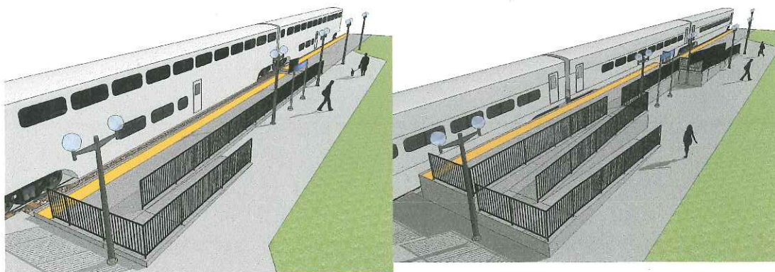
Figure 1. Set Back Platform Concepts

Left: 75' "setback platform" designed to serve bilevel or other equipment boarding at 15" above the rail Right: 75' "setback platform" designed to serve single level or other equipment boarding at 48" above the rail